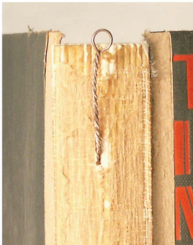
Fig. 3. Ten Years in Soviet Moscow . Exterior side view of the wire loop.