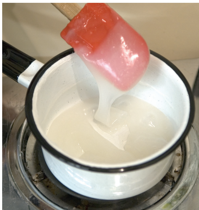
Fig. 6. Bubbles develop and elongate. Paste takes on a slightly gelatinous or rubbery quality and becomes more opaque.