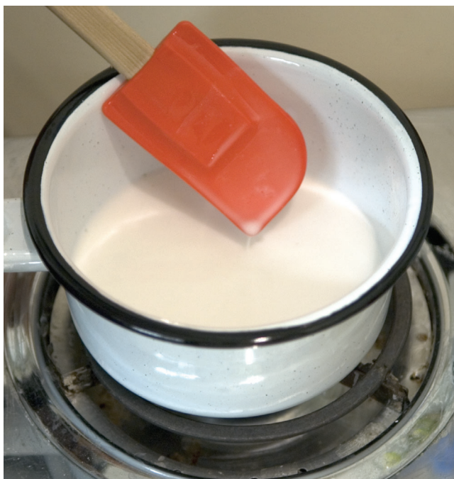
Fig. 2. Starch-water mixture is opaque white with a thin, milky consistency.