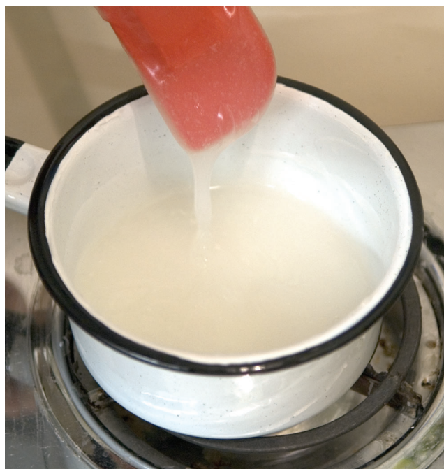
Fig. 5. Air bubbles develop as paste thickens further.