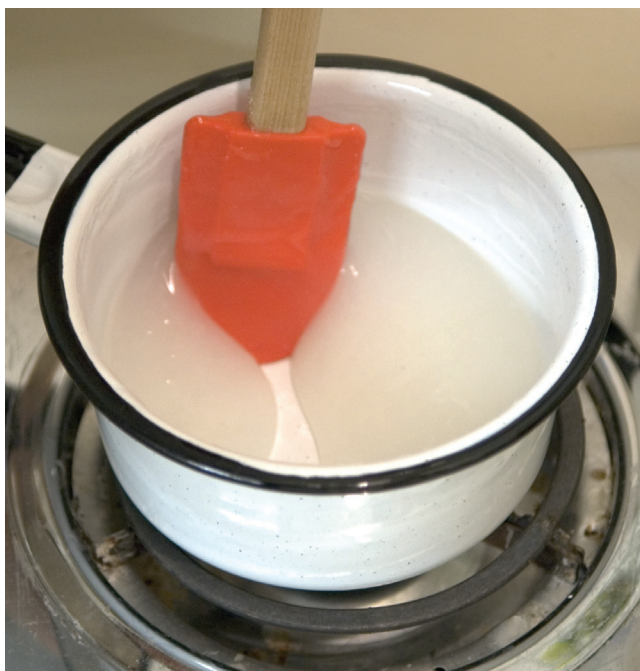
Fig. 4. Paste continues to thicken and becomes “syrupy.”