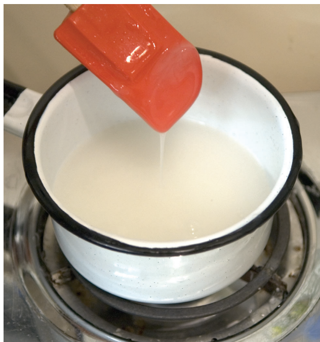
Fig. 3. Mixture becomes translucent and thickens slightly.

Shear strength of the test hinges was evaluated by lightly tugging at the bottom of the hinged sheet. Batches 1, 2, and 3 all produced strong hinges that held with no visible distortions in the hinged sheet. The consistency of batch 4