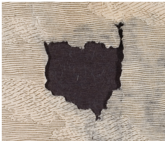
Fig. 7. A detail of the loss, recto. A template, made by tracing the loss onto polyester film, was used to make an outline of the fill to be cut from a thin western laid paper