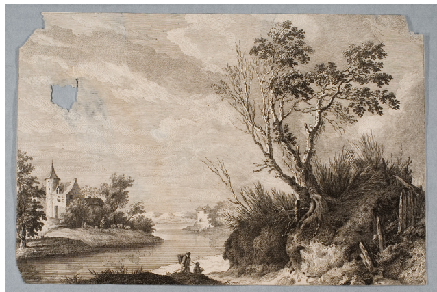
Fig. 6. An etching with an irregularly shaped loss in the upper right quadrant