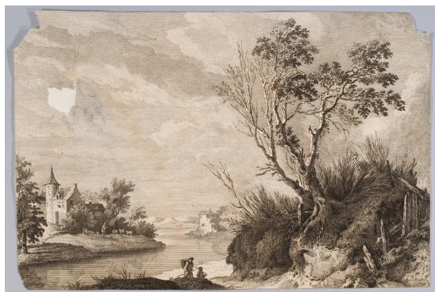
Fig. 10. The fill adhered to the print with wheat starch paste