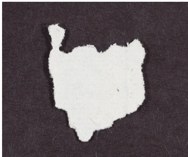
Fig. 9. The fill after it has been pulled away from the rest of its sheet