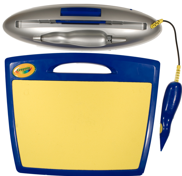
Fig. 1. The Crayola Cutter

The Crayola Cutter can be used to create a variety of fills for losses ranging from simple to complex in works on paper. In this case, the precision of the Crayola Cutter allowed a fill to be cut quickly and easily for a small, complex loss. See figures 6–11.