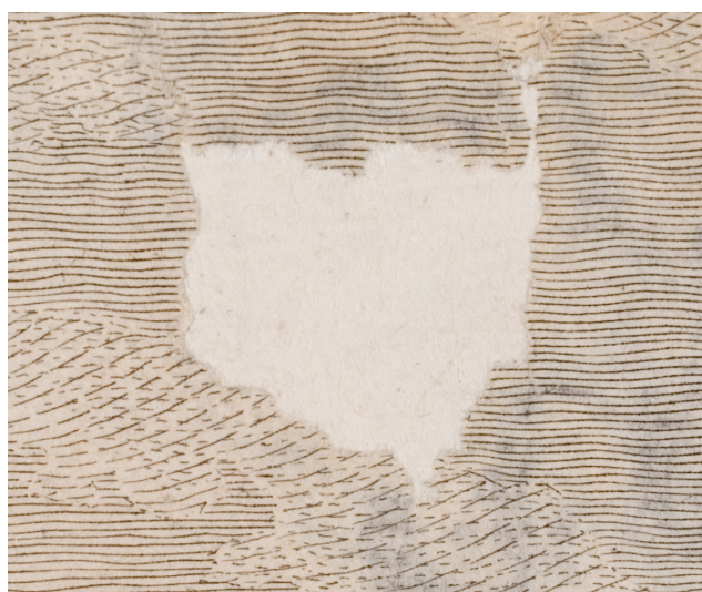
Fig. 11. A detail of the fill, recto. The edges of the fill were pared down and feathered further using water and a needle