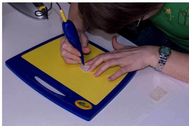
Fig. 8. Following the pencil line with the Crayola Cutter to create a perforated outline